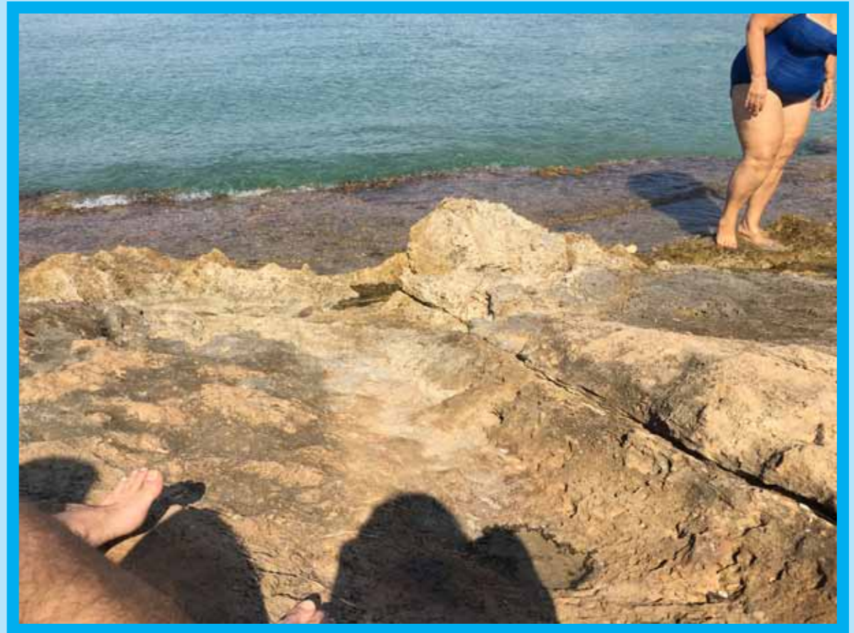
The sea in Livadi is crystal clear with sand inside, surrounded by some flat rocks. It is quite shallow up to a point and when the water is calm it feels like an endless swimming pool.