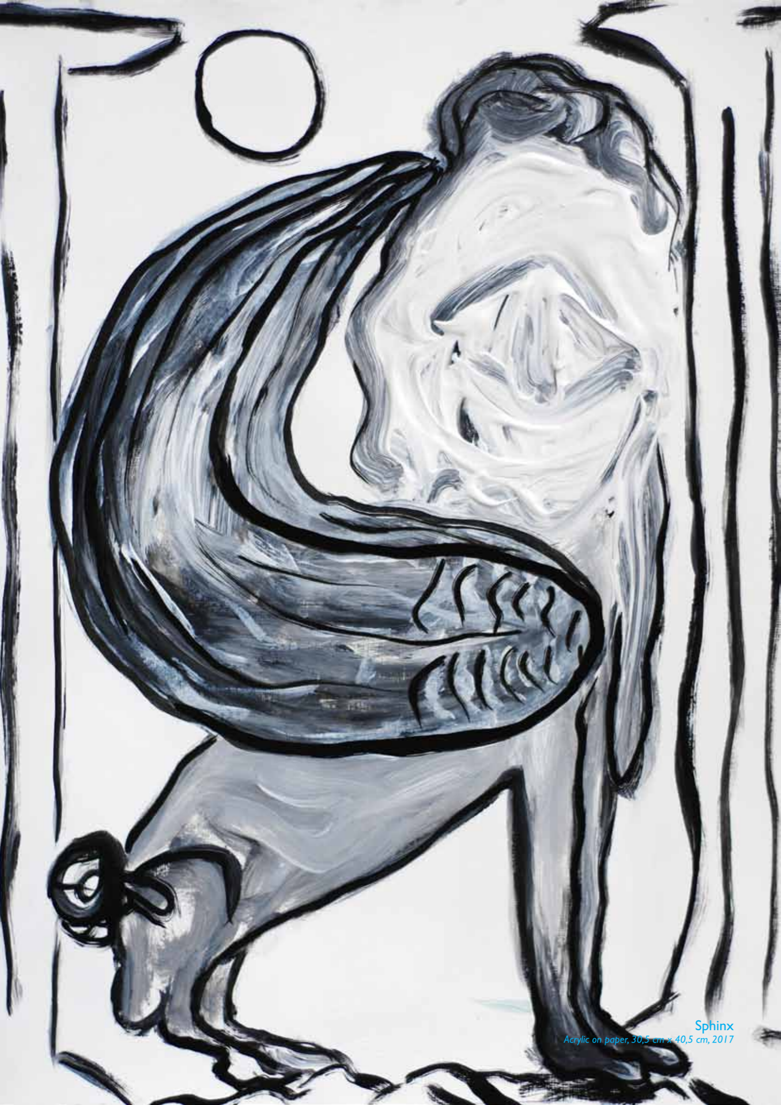
Sphinx Acrylic on paper, 30,5 cm x 40,5 cm, 2017