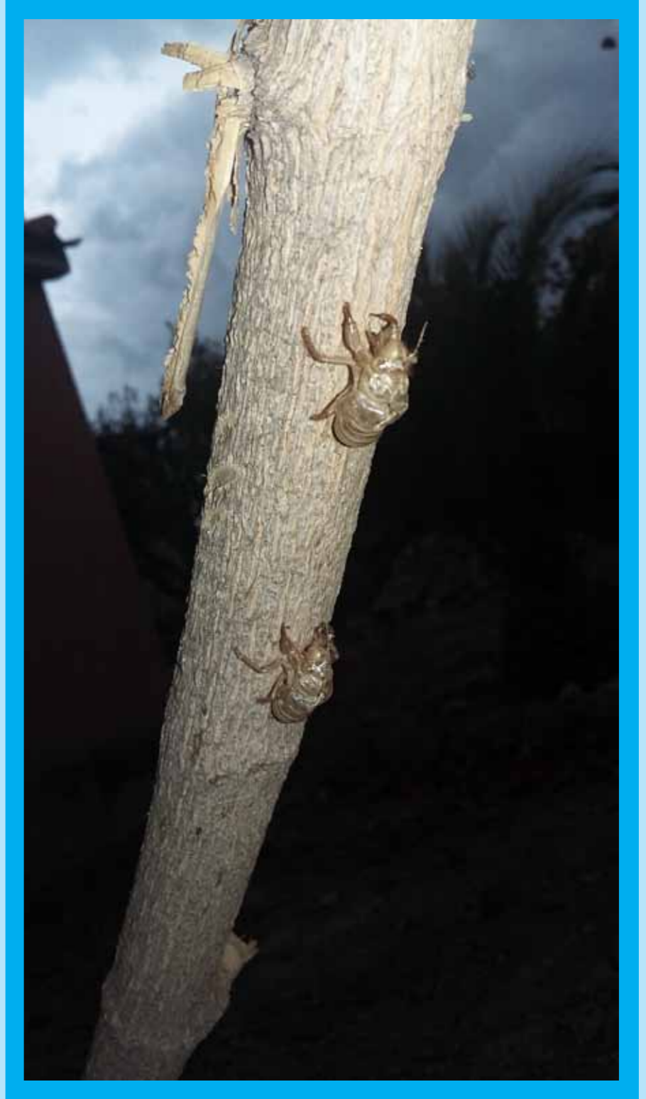
There are so many cicadas in Livadi area that sometimes the sound is deafening.