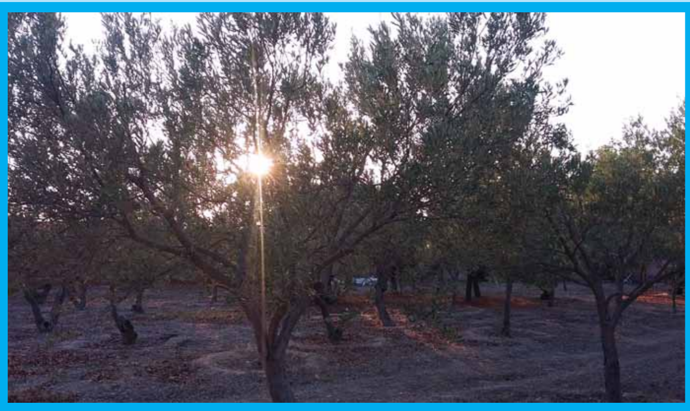
Pistachio and olive trees in Livadi, at Spyros Manolios estate.