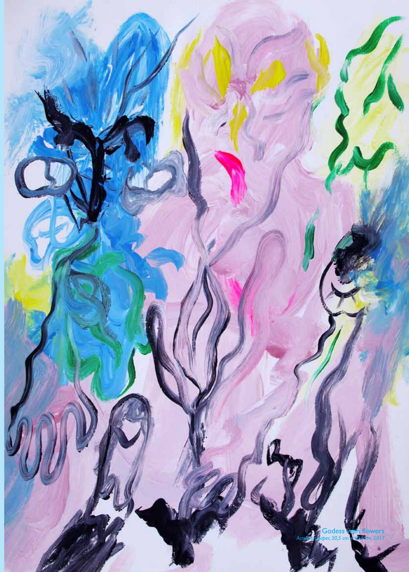
Godess with flowers Acrylic on paper, 30,5 cm x 40,5 cm, 2017