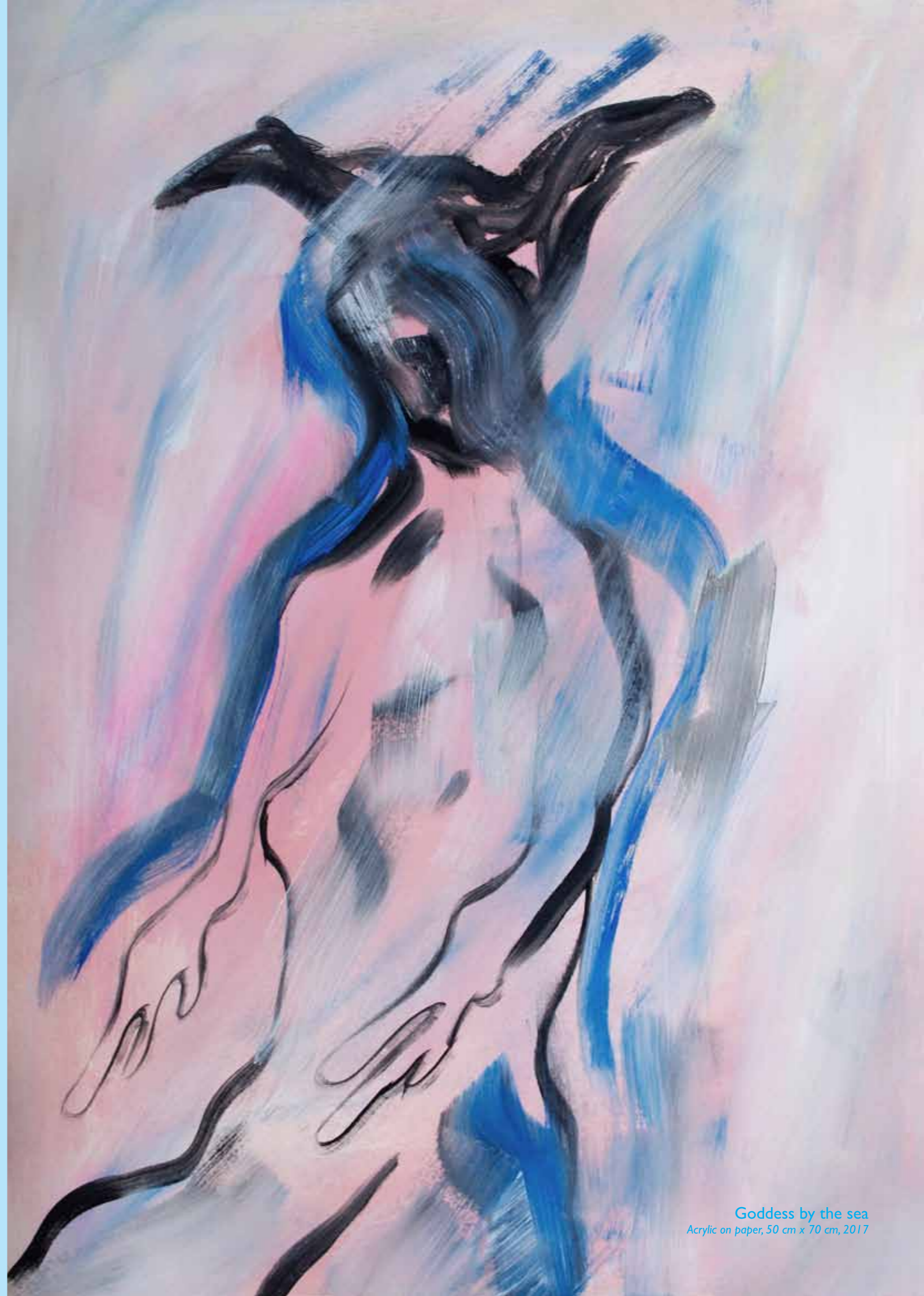
Goddess by the sea Acrylic on paper, 50 cm x 70 cm, 2017