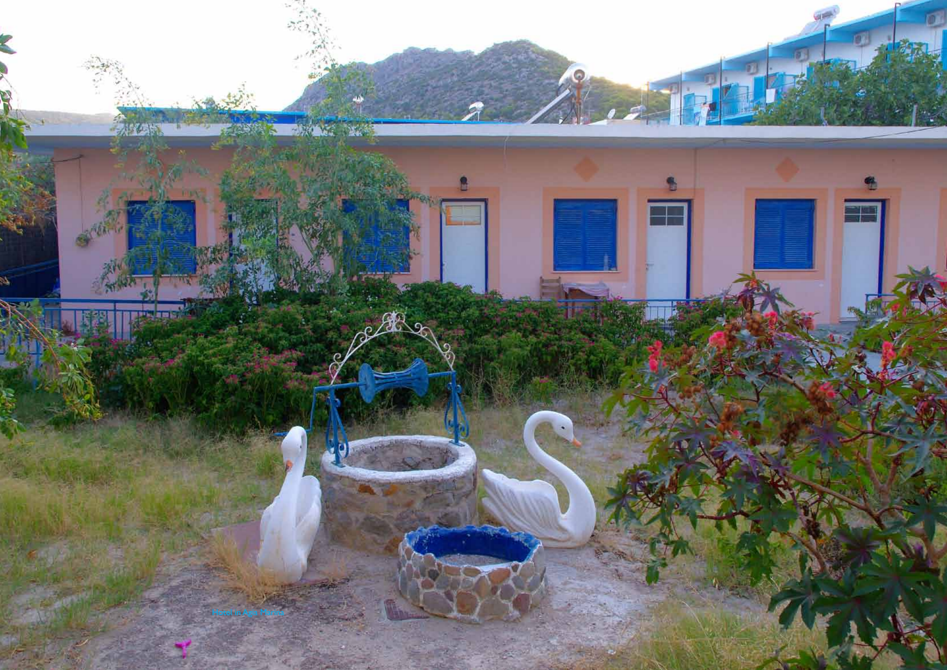
Hotel in Agia Marina