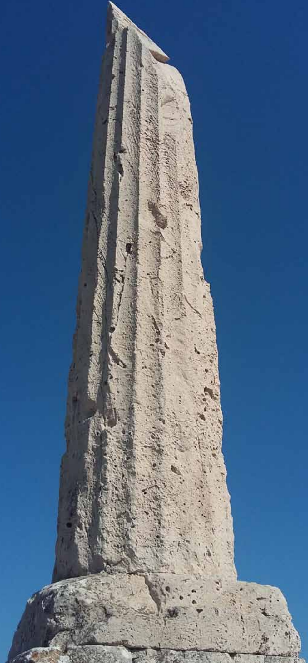
The other main archaeological site is located in the town of Aegina. Kolona, the ruins of the Apollo temple and an ancient settlement.