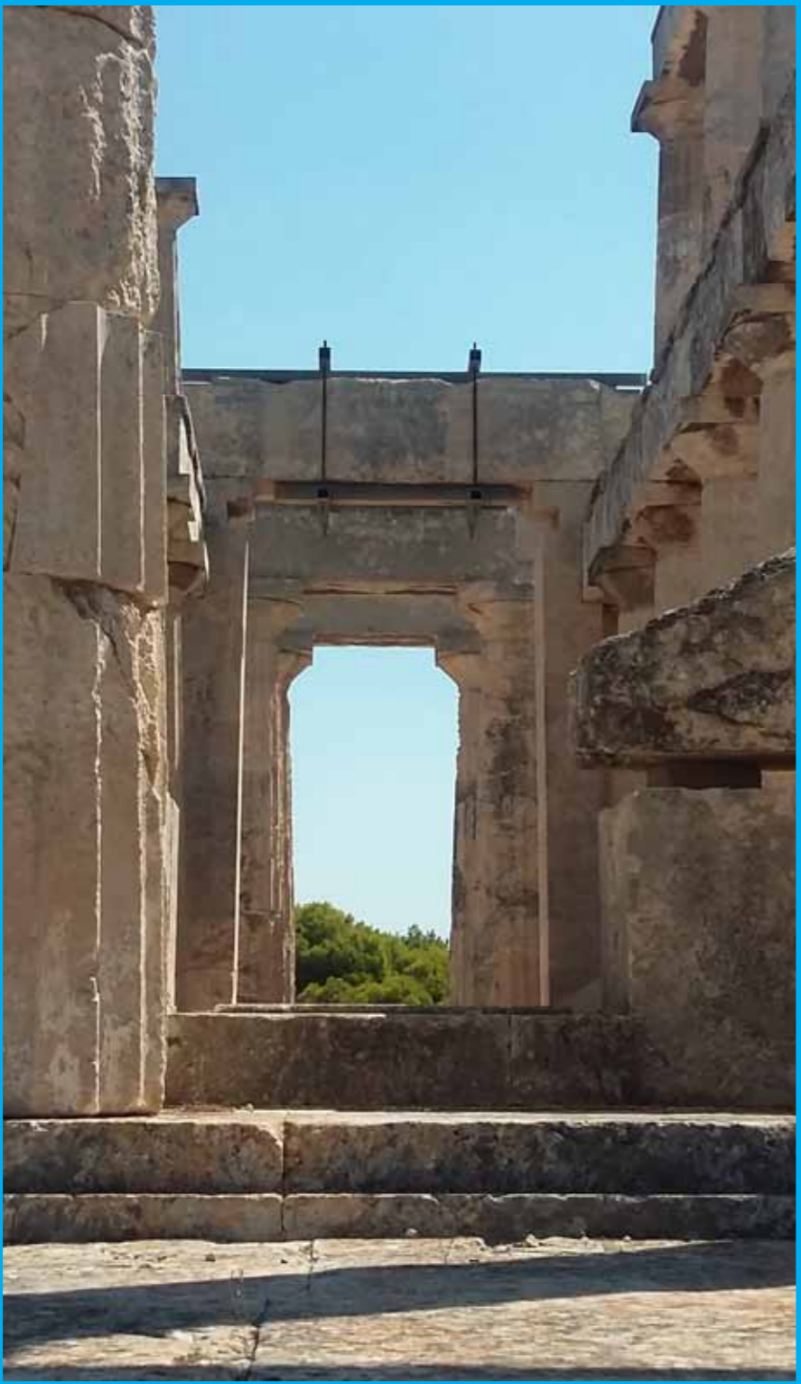
The temple of Aphaea is located on a hill within a sanctuary complex dedicated to the goddess Aphaea. Aphaea means the one you cannot see.