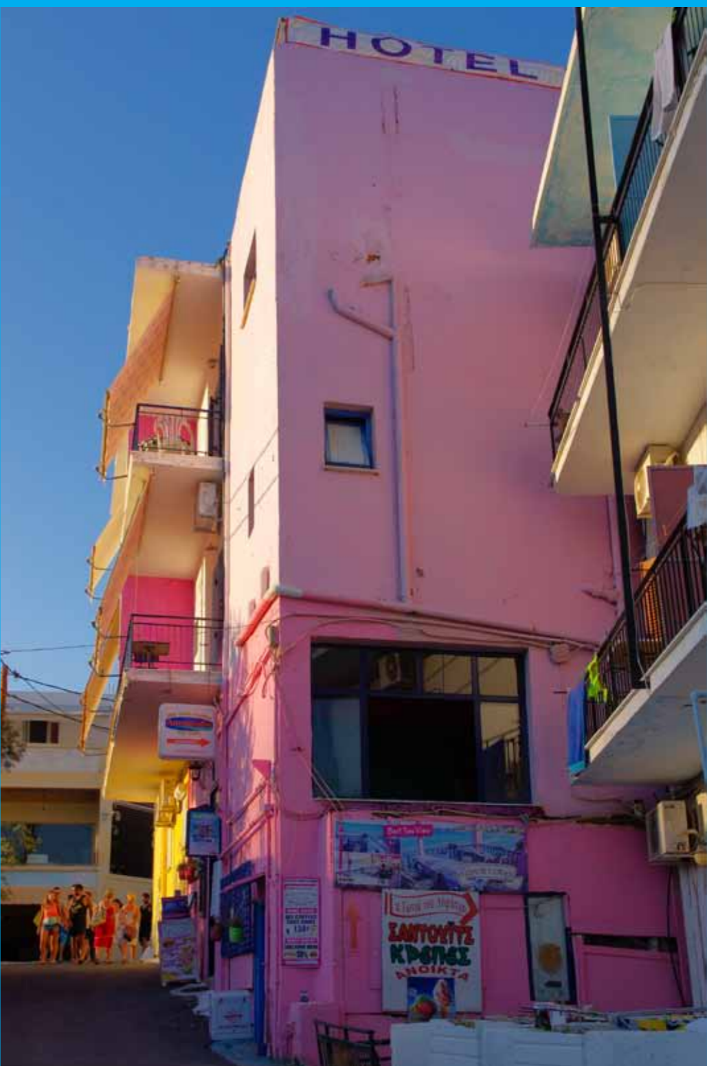
Characteristic hotel buildings in the town of Agia Marina.