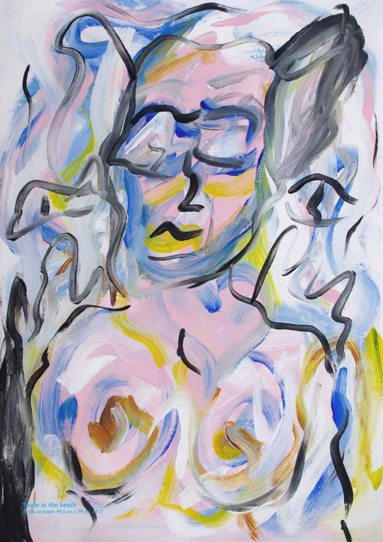
Nude at the beach Acrylic on paper, 49,5 cm x 79 cm, 2017